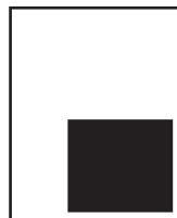
1/3 Square 4 3/4" X 4 1/2"