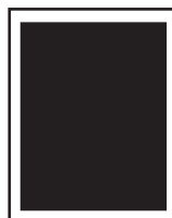
Full Page 7 1/8" X 9 1/4"

Printed Web Offset on Electrabrite stock. Cover is gloss stock.