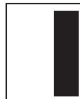
1/3 Vertical 2 1/4" X 9 1/4"