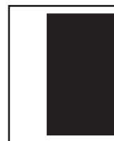
2/3 Page 4 3/4" X 9 1/4"