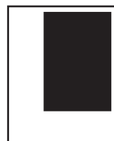
1/2 Page Island 4 3/4" X 6 3/4"